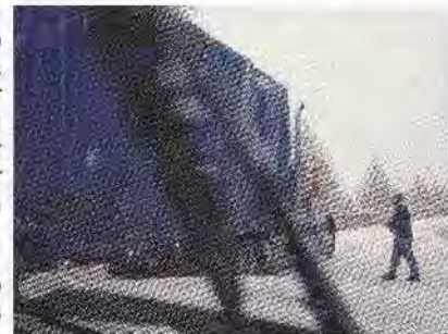
View of the alfalfa truck that slid into us.

The winter makes finding places to stay with your horse even harder since so many horse campgrounds are closed. I would recommend taking your Ride & Tie Handbook along with you when you travel and using the members list for possible places to stay. If you are on Washington's Olympic Peninsula, you are always welcome to call us. I also stayed at the Humboldt County Fairgrounds in Ferndale. Fairgrounds are possible places to stay with your horse. They are especially good in the winter when they are not so busy with horse and livestock activities.