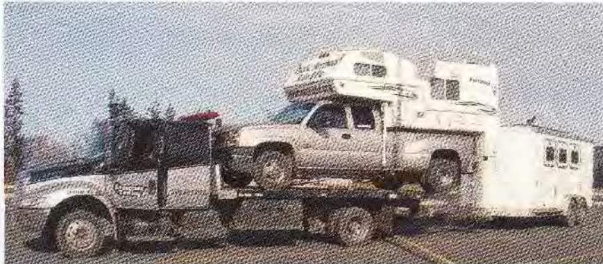
USRider contracted tow truck hauled our truck, camper and horse trailer 20 miles for repair.