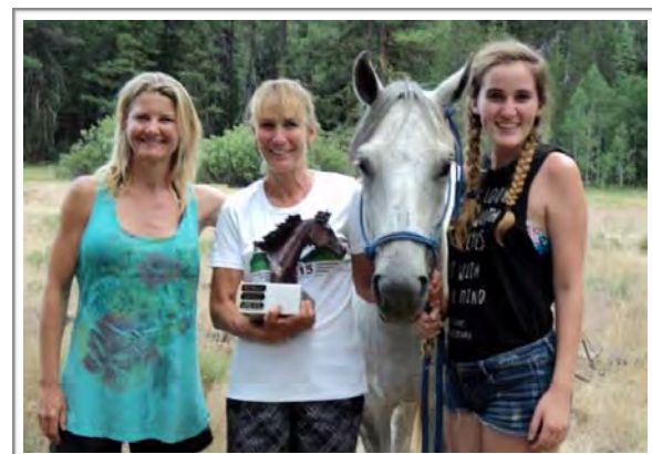
Best Condition Horse Duncan