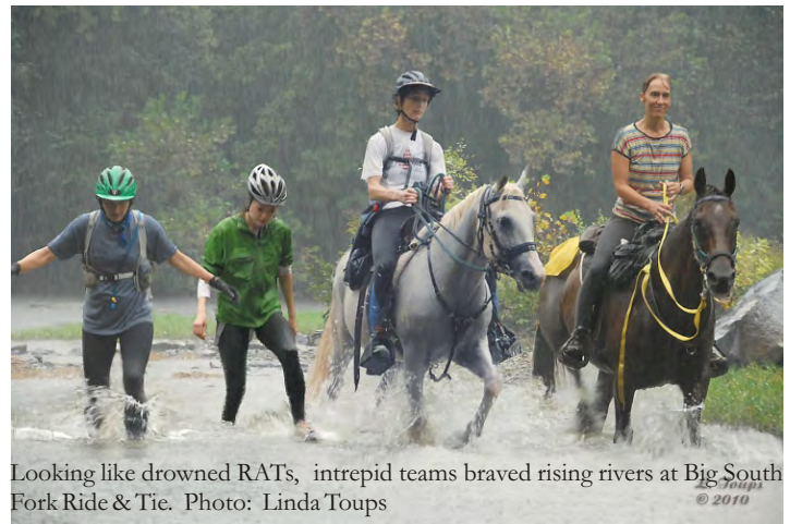
Looking like drowned rats, intrepid teams braved rising rivers at Big South Fork Ride & Tie.