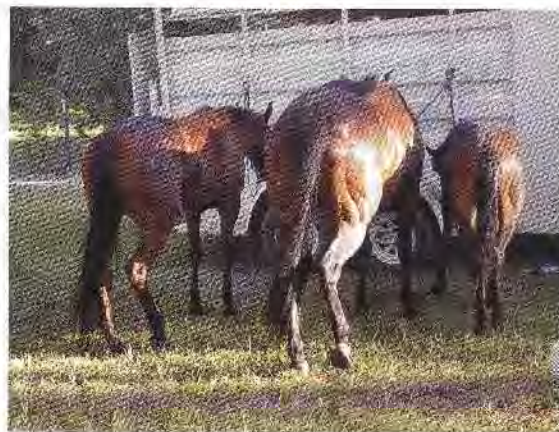
Solo Discussing the Possibility of Adoption