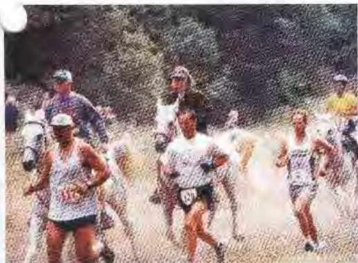
November's Mystery Photo

Congratulations to those brave souls who ventured a guess about our November's Mystery Photo! They were all in agreement and so MUST be right! Thanks for your guesses. Now how about this issue's mystery?