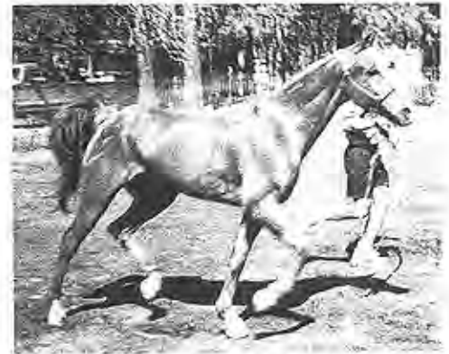
What's on tap for 2000?

* Wins the BC and Reserve Champion awards at the IAHA 100 mile National Championship held at the Swanton 100.